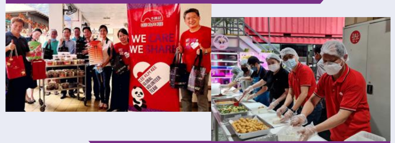
Support Project Dignity Singapore for Meal Distribution 支持新加坡社企「廚尊」為弱勢社群派飯