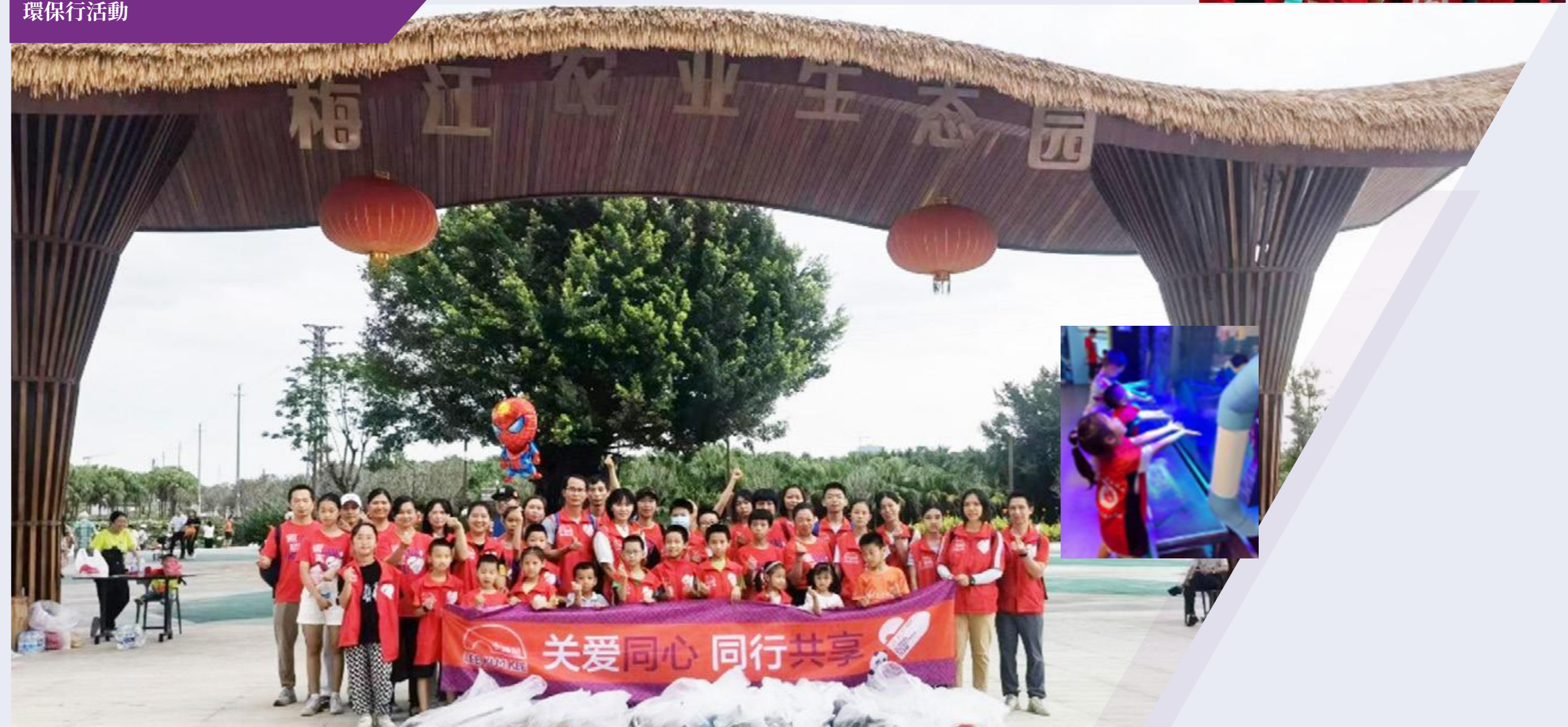
Maintenance of Lee Kum Kee Forest 李錦記樹林維護活動